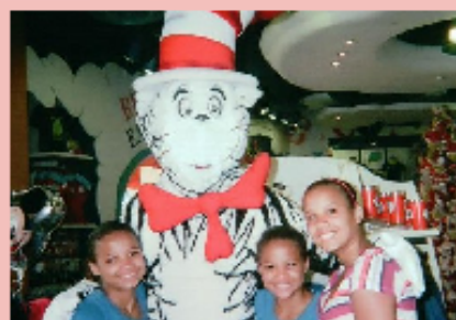
Baldwin takes on NYC!

From photos we received, looks like Aleeya enjoyed Universal Studios & visiting with the Disney Princesses the most!